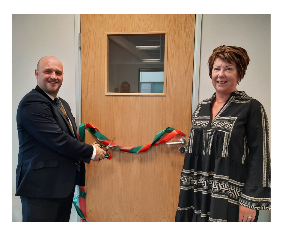
Dafydd Llywelyn Police & Crime Commissioner & Tracy Pike, MBE

We have been able to hold more training courses, thanks to our new conference suite, screen and hybrid system. We are also in the process of developing new courses to make us all more resilient as we continue to chart though difficult seas.